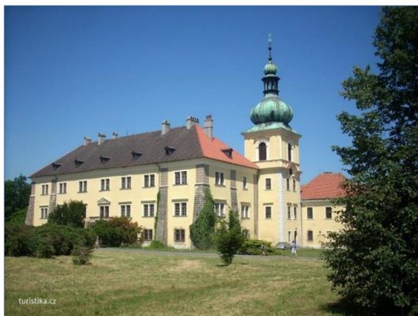
The Doksy castle

The town of Stare Splavy, situated on the northern shore of the lake, became part of Doksy in 1850 and has ever since contribute to the development of tourism in the region.